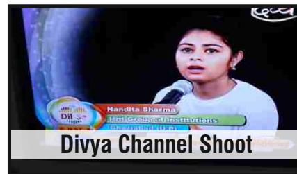
Divya Channel Shoot