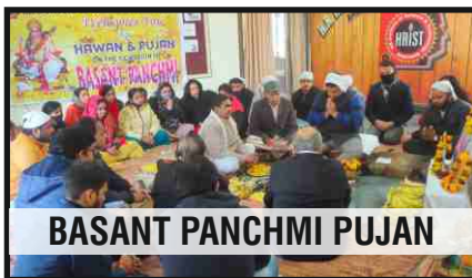
BASANT PANCHMI PUJAN