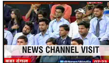
NEWS CHANNEL VISIT