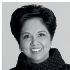
Indra Nooyi Former Chairperson and CEO, Pepsico