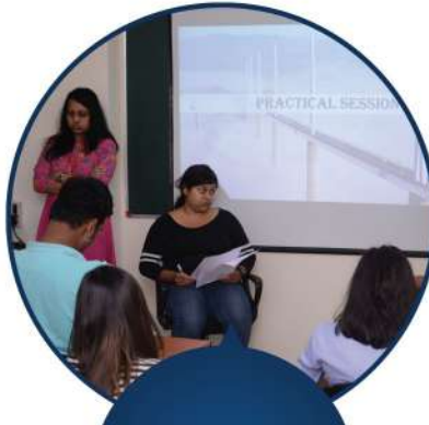
Role - Plays