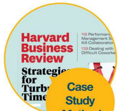
Case Study Method